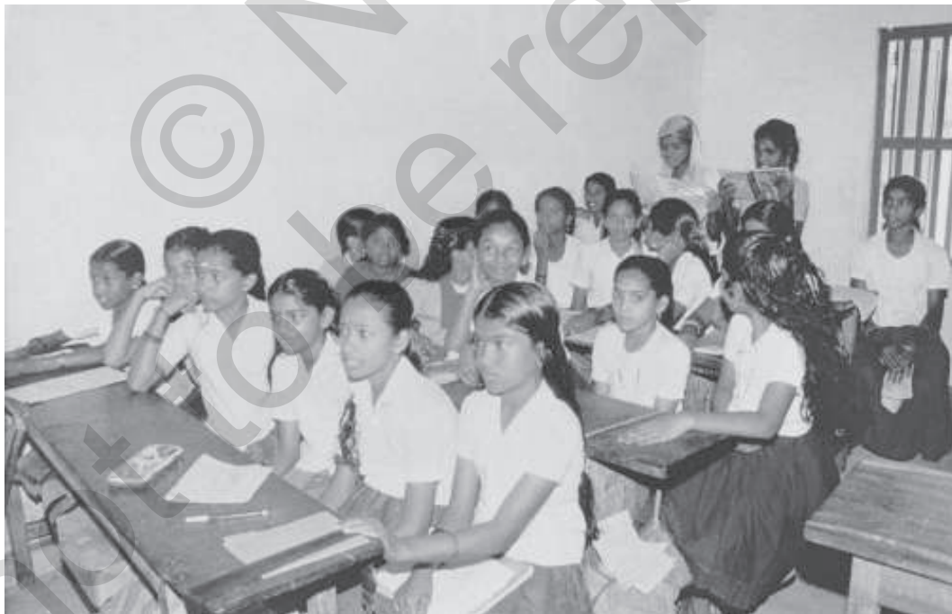
Students in a classroom

But by far the most common way of classifying social change is by its causes or sources. Sometimes the causes are pre-classified into internal (or endogenous) and external (or exogenous) causes. There are five broad types of sources or causes of social change: environmental, technological, economic, political and cultural.