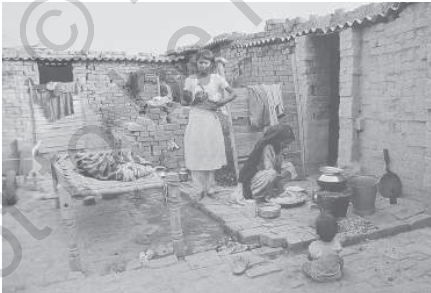
A girl child looking after the sibling

Where and how people will live in cities is a question that is also filtered through socio-cultural identities. Residential areas in cities all over the world are almost always segregated by